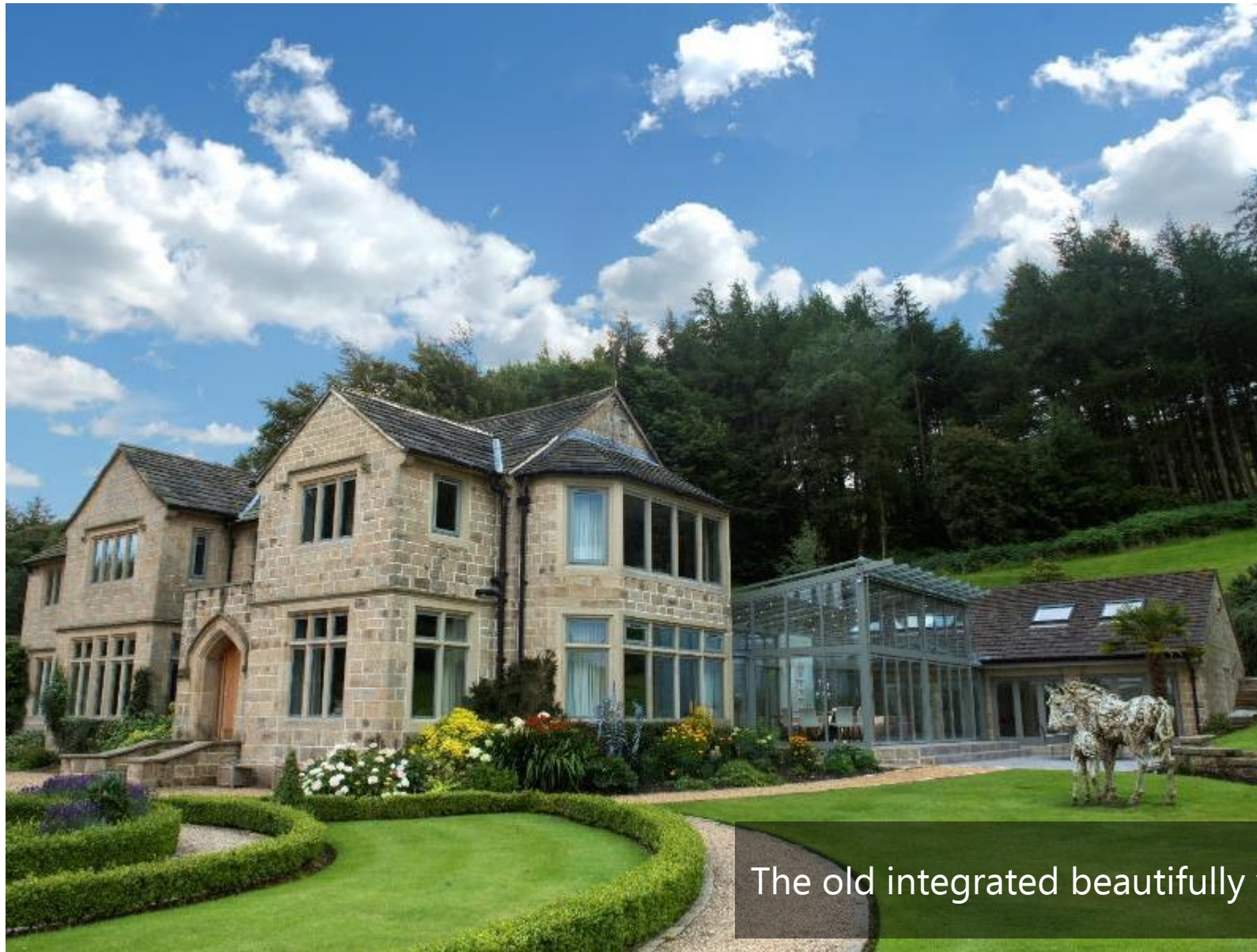
The old integrated beautifully with the new