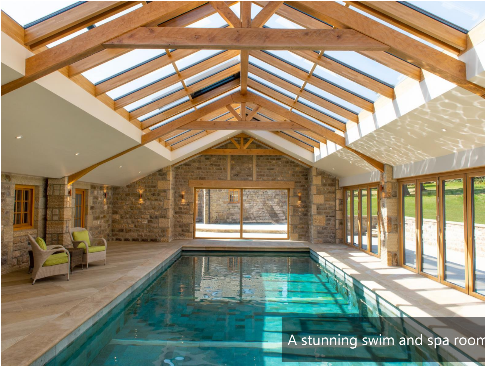
A stunning swim and spa room open to the sky