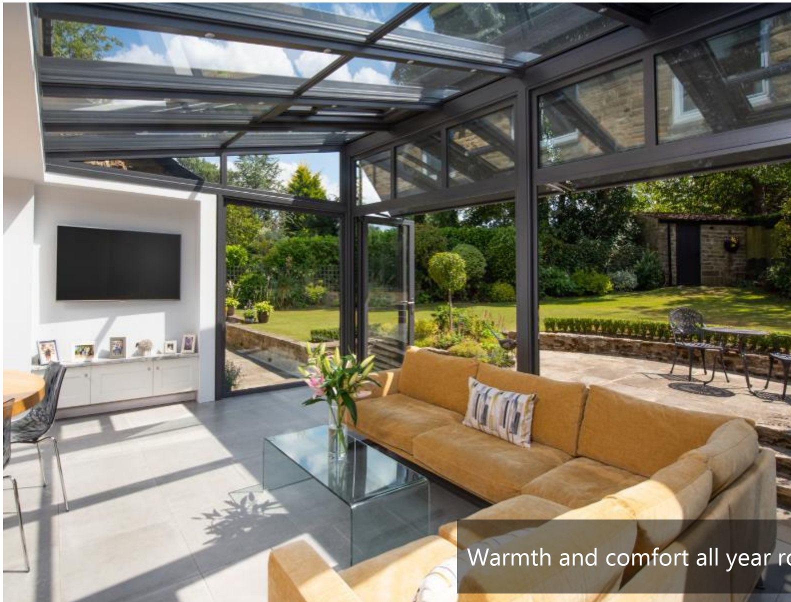
Warmth and comfort all year round